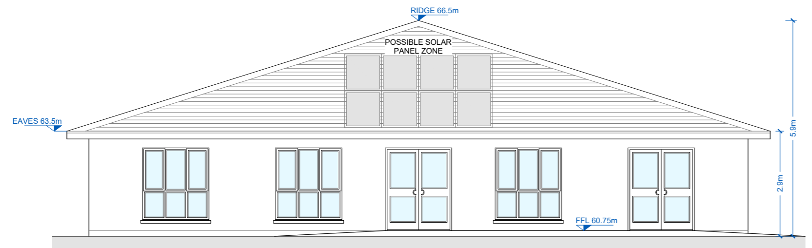
LEFT SIDE (SOUTH EAST) ELEVATION SCALE 1:100