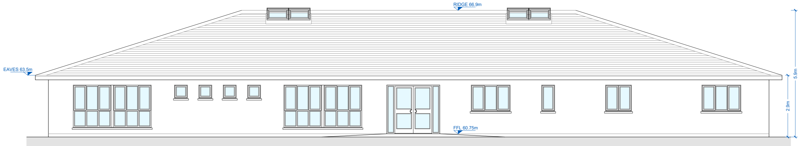
FRONT (NORTH EAST) ELEVATION SCALE 1:100