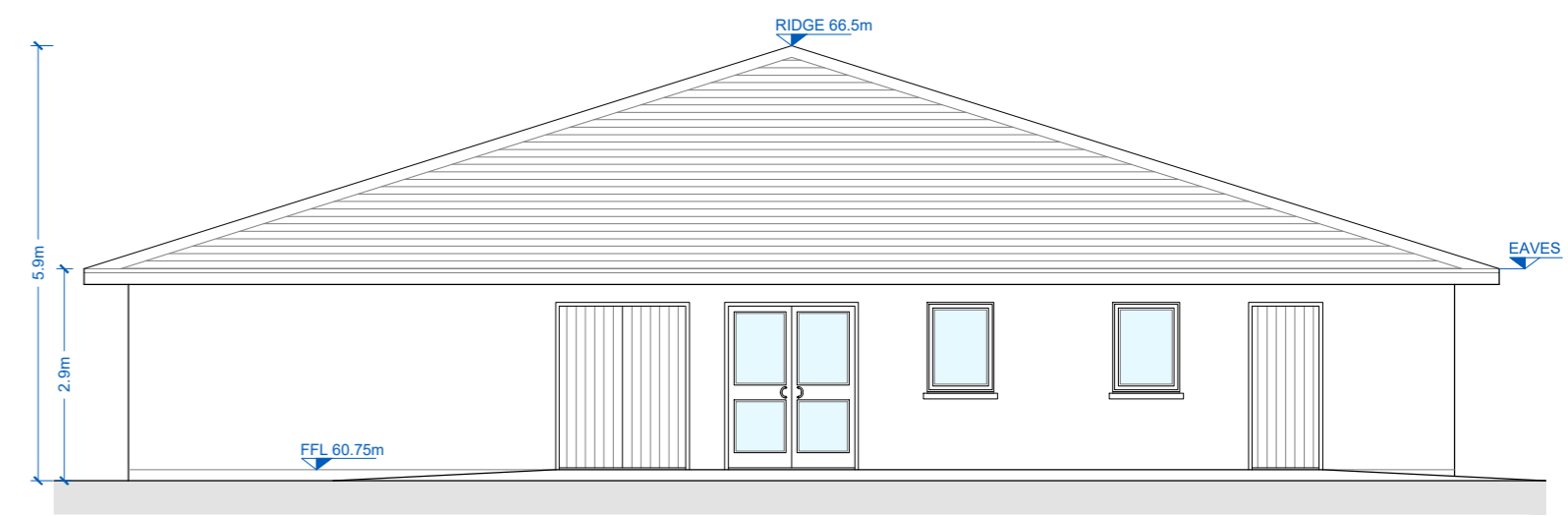
RIGHT SIDE (NORTH WEST) ELEVATION SCALE 1:100